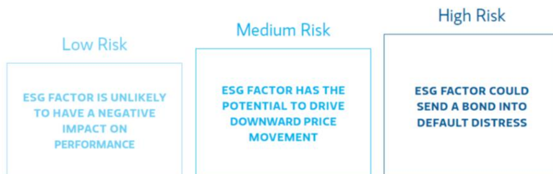
Figure 3. “Sector Risk Factor Weightings”. Source: Morgan Stanley Investment Management, 2019.

On top of the reputational risk on the one hand, there may also be a "green default risk" - also described as litigation risk. Morgan Stanley has classified the corresponding risks in ESG bonds as follows.